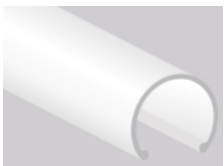
Opal (80% transmission)